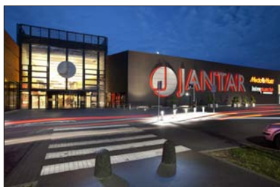
Shopping Centre Jantar in the Polish city of Slupsk has changed ownership: CBRE Global Investors acquired the property from Tristan Capital Partners.