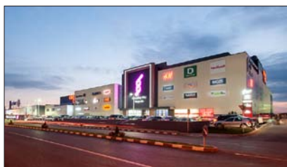
Shopping City Timisoara is the biggest mall in Romania outside Bucharest and required an investment of EUR 83.8 million.