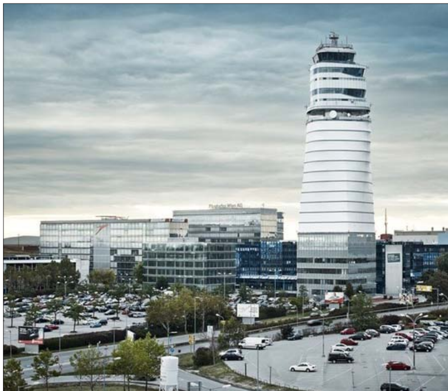
Vienna Airport City is characterised by short distances and vicinity to the terminals.