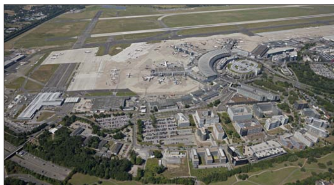
Aerial view on Düsseldorf Airport City (right) and en detail the office building Panta Rhei (left) owned by Immofinanz.

(Österreichische Bundesbahnen, Austrian Federal Railways), securing not only quick connections to Vienna Main Station but also offering direct trains to Linz, Klagenfurt and Salzburg. Like in Frankfurt also in Vienna the direct and completely covered access to the long distance railway station is augmenting the attractiveness of the airport city.