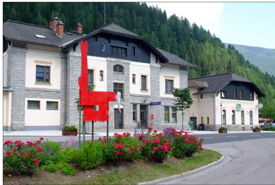
On the station square and on other public places – Mallnitz is attracting by art.

has only limited accommodation capacities, as Erika Schuster stated. So mainly day-trippers are coming to Gmünd. In contrast, Mallnitz has the advantage of sufficient accommodation capacities.