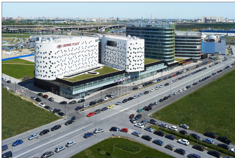
Airport City St. Petersburg – the Crowne Plaza hotel and two of the office buildings

What is also important for an airport city is the real estate market in the respective city: does the city offer abundant and attractive office and retail space, then the airport city is only one location among others. Is the offer in the city only small then the airport city has a bigger chance of success. For companies who have no need of an airport in direct neighbourhood inner city locations or new office districts compete with the airport city and this competition might be even stronger than the competition among airport cities themselves. | Andreas Schiller