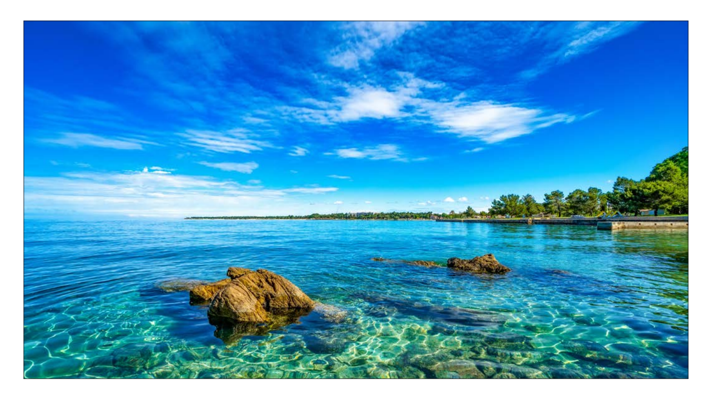
Mediterranean climate and blue sea – these are the "assets" that make Croatia a sought-after tourist destination.

Since 1 January 2023, Croatia is part of the Schengen area and has introduced the euro as its national currency. In the country itself, this is associated with both hopes and fears. But it is likely to put the country increasingly on the map for international investors.