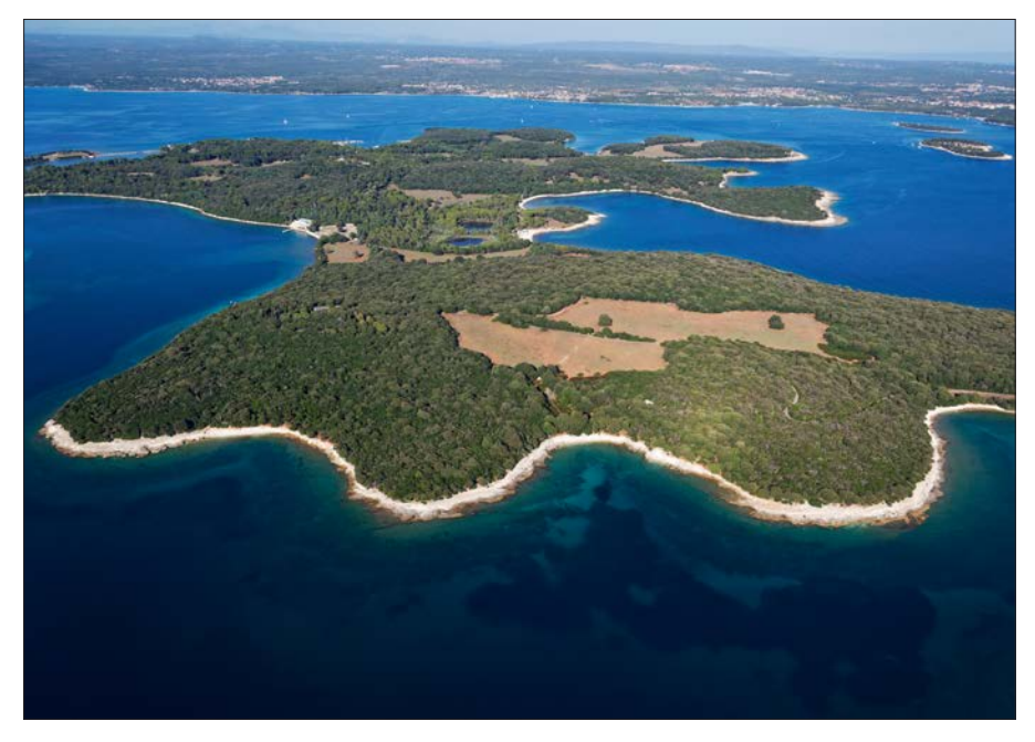
Brijuni Velika, the main island of the Brijuni archipelago, is now a national park.

developed is north of Fažana – Fažanska Pineta. The second site Hidrobase is northwest of the city of Pula, and the third option on the development programme is the Muzil peninsula located southwest of Pula. All three sites are located directly on the coast and opposite of the Brijuni Islands.