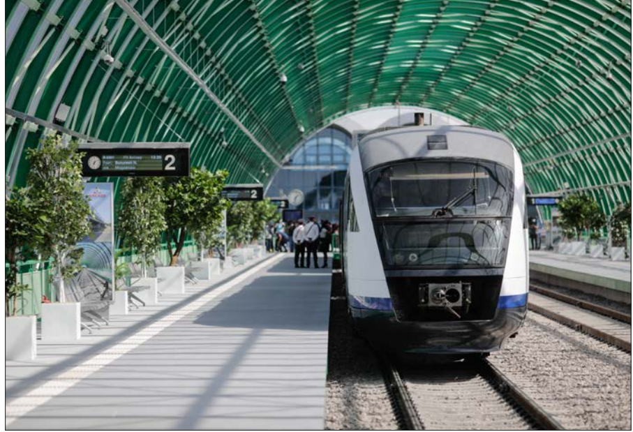
Modern mobility concepts should reduce individual car traffic in the city.

traffic. As the Primaria Sibiu reported at the conference, they've made the city pedestrian-friendly, created bike lanes and set up a rental system with 500 bikes.