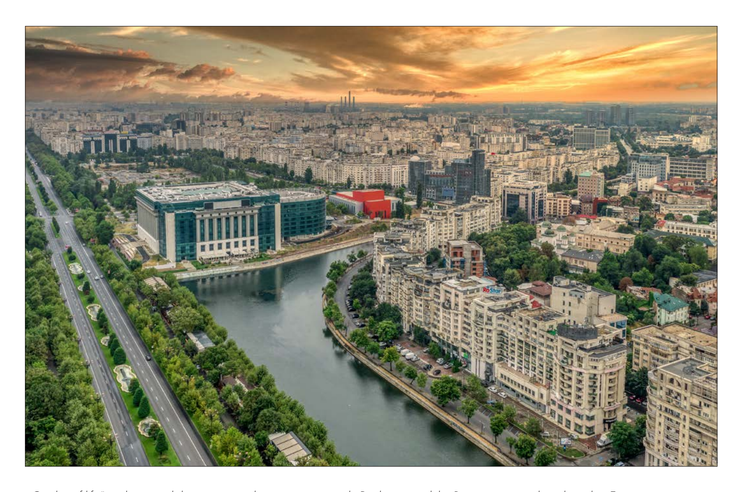
"Quality of life" and sustainability are topics that concern not only Bucharest and the Romanian cities, but also other European cities.

Romania is not only a very diverse country in terms of landscape. Equally diverse are the challenges to which the country's cities in particular have to respond, but also the opportunities that are on offer.