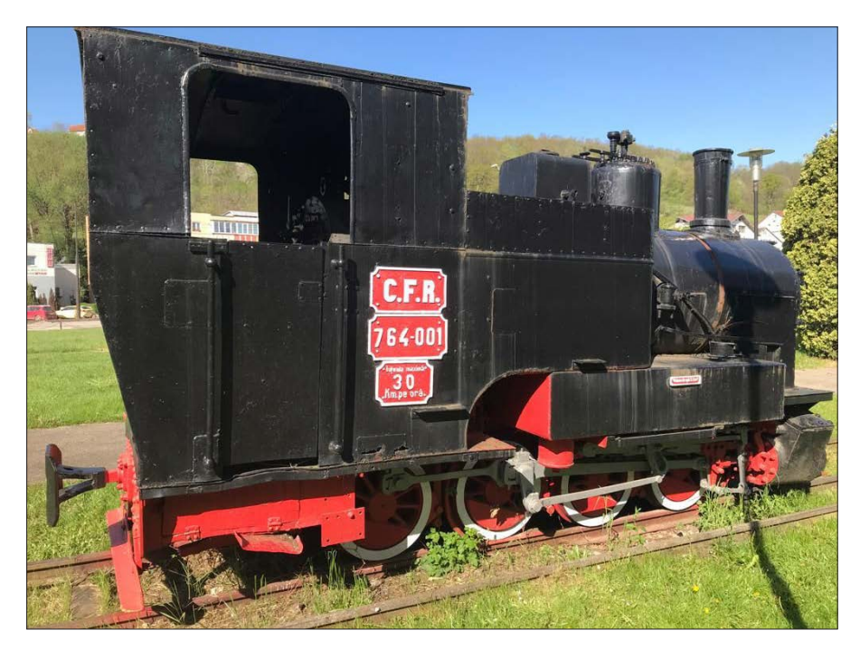
From Reşița's glorious past: one of the locomotives built here.

However, this does not mean that all traditions have been thrown overboard. How proud the people of Reşiţa are of the industrial past is not only shown by the locomotive museum. In order to preserve identity, the cooling tower of the industrial wasteland, for example, is being preserved and the former ropeway for material transport, a landmark of the city,