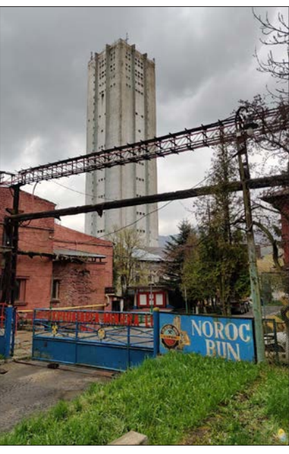
Scenically, the Valea Jiului leaves little to be desired, but the closure of the coal mines means a severe structural change.

A recurring theme at the "Cities of Tomorrow" conference is "Reconversion & Revitalisation". This is easier in larger cities and in areas popular with tourists than in more remote regions such as the former mining areas in the Jiu Valley and in the region around the former steel industry town of Reşiţa.