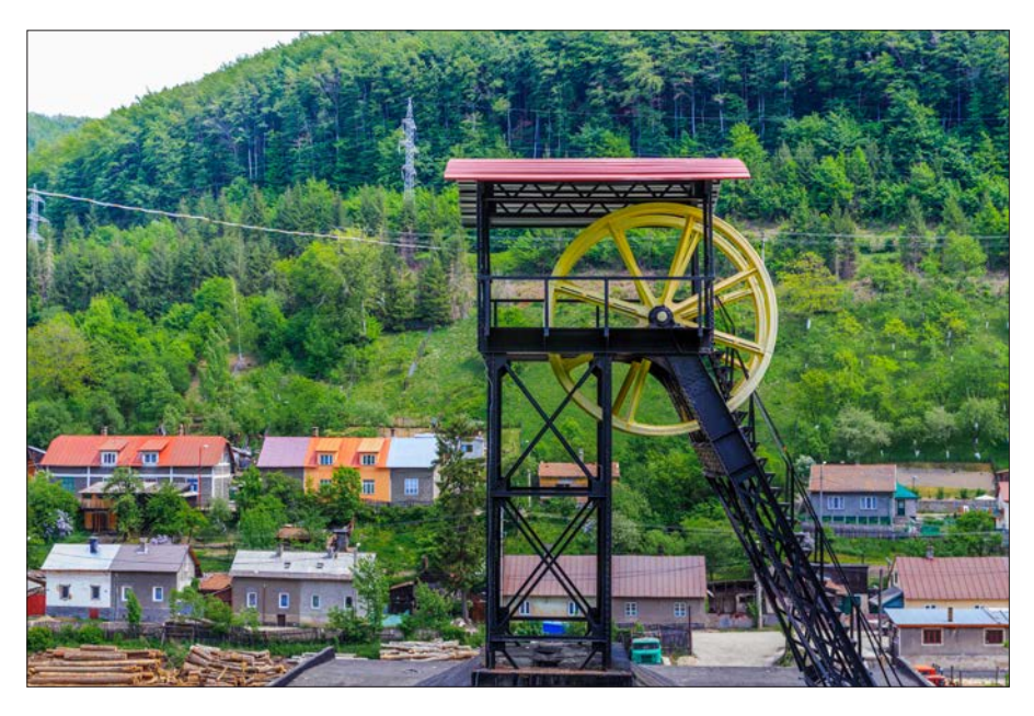
Winding towers like this one in Anina bear witness to the region's mining past.

Hunedoara is only about 15 km away, both cities are about the same size (around 60,000 inhabitants), and yet they could not be more different. It is true that Hunedoara also has a castle, also in a prominent location and conceivably well preserved. Hunedoara is not called "Eisenmarkt" (Iron Market) in German for