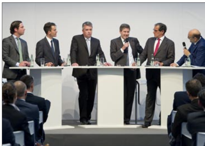
Left the signing of a "Memorandum of Understanding" between RHDF and RUTID, right the panel discussion on family offices.

mosphere? However, that does not mean to behave like that visitor dressed in a visibly expensive suit who dropped in a stand near the entrance and expressed only one interest by pushing the claim "a coffee, please". May be, he mistook the counter on the stand with a bistro.