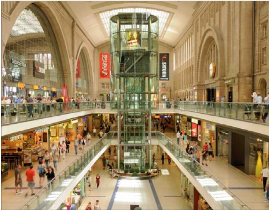
Popular: transportation facilities like railway stations and airports as shopping malls

there is to state a boom in warehouses and distribution centres because logistics is gaining importance by e-commerce. To put it in a nutshell: logistics are the winners of the changes in the retail landscape.