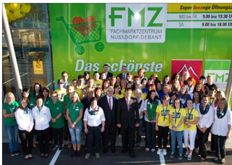
Qualified service staff is the advantage of stationary retail against e-commerce.

This fact, however, may be also a disadvantage of e-commerce because quali-